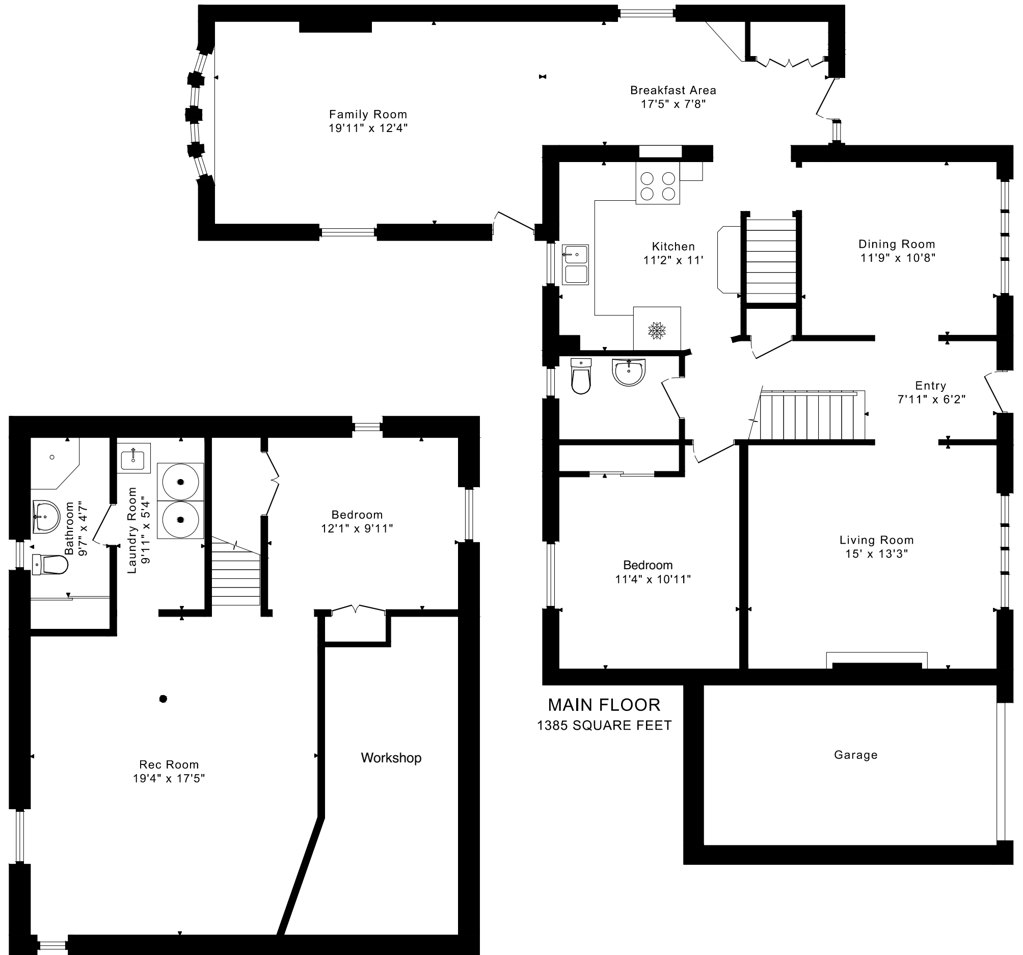
LOWER FLOOR 930 SQUARE FEET